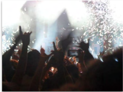
The Most Beautiful Moment in Life , Chloe Strachan, 2016