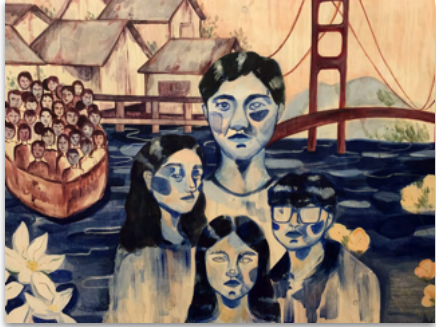
Pathways , Klya Dang, 2020