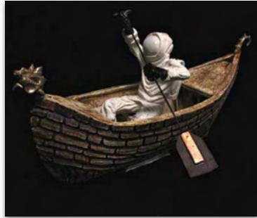
In Orbit , Harriet Cassell, 2015