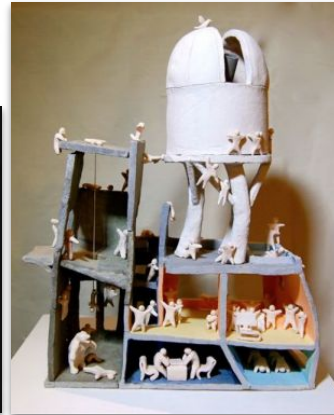
House of Disorder , Kane Tanaka, 2014