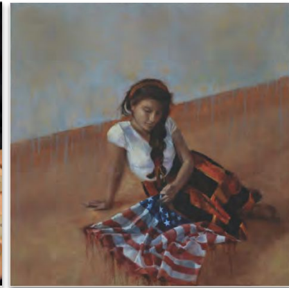
La Sangre del Sueño , Saloni Kalkat, 2012