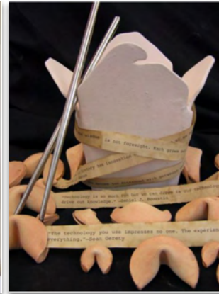
The Future Is Encrypted , Danielle Chan, 2013